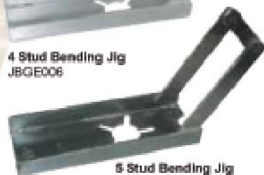
5 Stud Bending Jig JBGE007