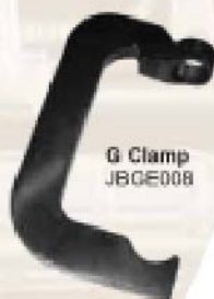
G Clamp JBGE008